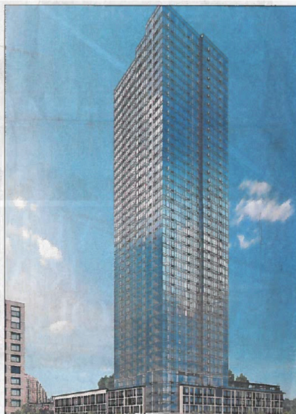
Vantage is a 448-unit building created by Fisher Development Associates in the Liberty Harbor North neighborhood of Jersey City. The 45-story waterfront tower features studio, one- and two-bedroom residences.