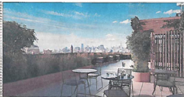
With the Manhattan skyline as the backdrop, residents of 75 Park Lane and Shore House in Jersey City can enjoy an expansive communal rooftop garden with a variety of seating options.