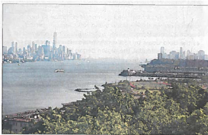
Located in Weehawken, Avora features unobstructed waterfront views, and residents are literally footsteps away from the ferry terminal and Light Rail station.

Look for this section on www.nj.com/d/goldcoastliving . For other sections, log on to www.nj.com/specialsections/starledger