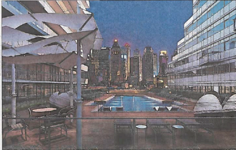
Avoca, a new 184-unit luxury condominium building rising on the Weehawken waterfront, features unobstructed views of midtown Manhattan.

The site had once been the Erie Railroad's Pavonia Terminal